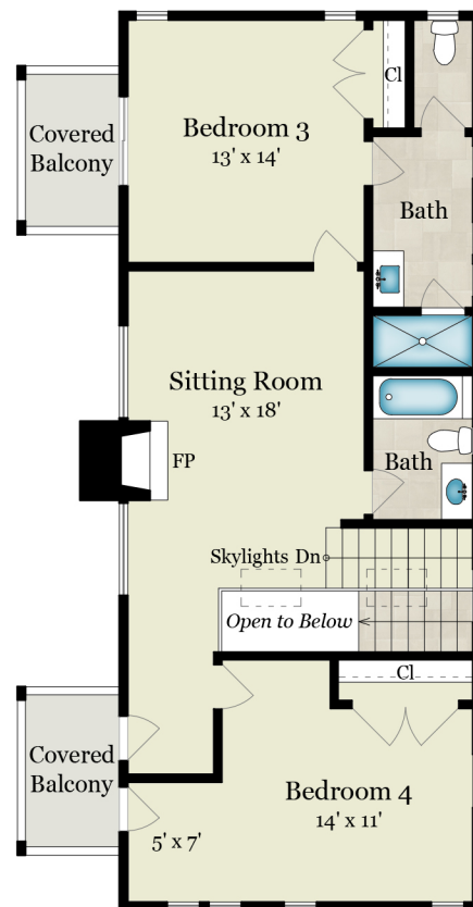
UPPER LEVEL 985 SQ FT